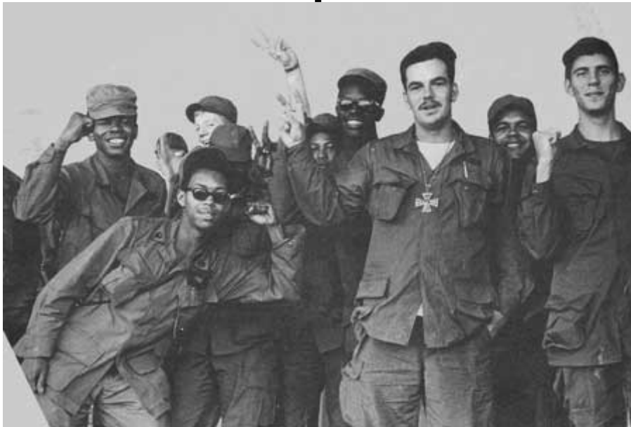
Vietnam: They Stopped An Imperial War